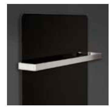
Towel bar Adaptable to the extent necessary and more bars can be fitted.